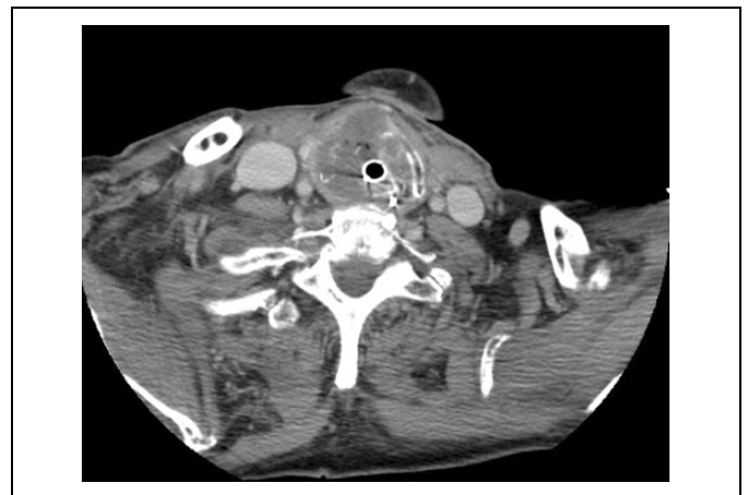
Figure 1. Computed tomography image showing an almost complete erosion of the laryngeal framework cartilages due to LMS. Residual airway is minimal therefore an emergency oropharyngeal intubation is needed.

Debridement of the necrotic tissue and drainage of the purulent collection was performed with direct laryngoscopy. Culture was positive for Staphylococcus epidermidis and Candida albicans . Intravenous antibiotic, antimicrobial, and corticosteroid therapy was administered, and other 3 surgical debridements and drainage were performed, but without clinical or radiological improvements. Moreover, patient developed signs of sepsis. Since no improvement had been achieved, total laryngectomy was planned even without a positive histologic biopsy. Intraoperative findings showed transglottic extension of the ulcerated material with full-thickness infiltration of the laryngeal wall and external spread through the thyroid