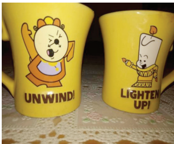
Figure 8. Family bond

Showing the photo to the reference operator, we received a reaction of satisfaction: “I am pleased, I am pleased that he recovers the drugs ...”, he says, in fact, that the patient has previously been discontinuous in taking pharmacological therapies: “... so much so that he always suspended them...”. Also in the initial presentation the operator describes the difficulties: “there was a bit to be fought with regard to pharmacological