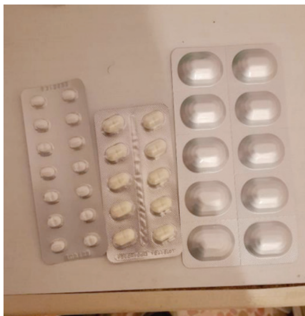
Figure 7. Pharmacological therapies to avoid relapses