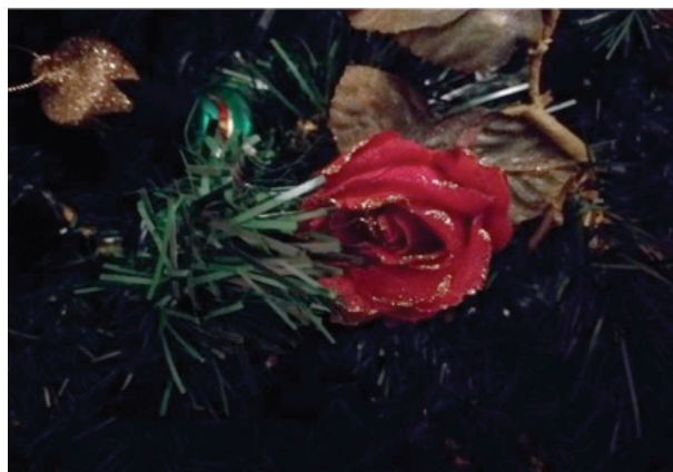
Figure 2. Fun with the family