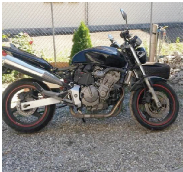
Figure 1. Personal pleasure

When the photograph of the Christmas decoration was shown, the user said: “It’s a day of celebration and when I’m in a good mood I can feel that life is a precious gift.” And then “Now that Christmas ... a sense of family that, I don’t have a sense of family in