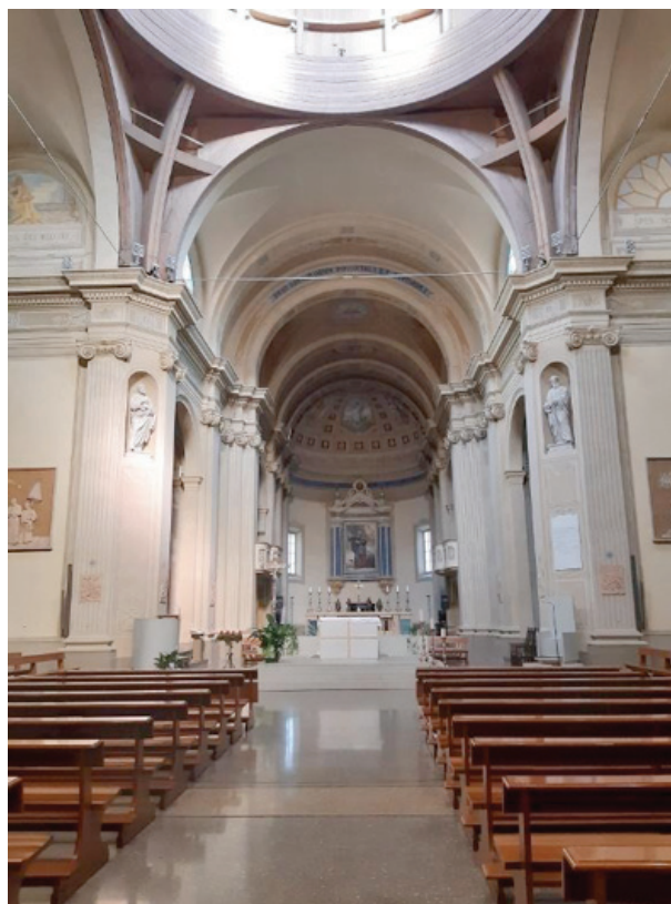
Figure 11. A place that evokes serenity

Analysing the various photographs taken by users for the area "a place where I am well" it emerged that the bedroom (or only the bed) is a recurring subject in all five cases analysed and interviewed; on the part of all five users emerged the need to photograph a comfortable and safe corner of their home, for all