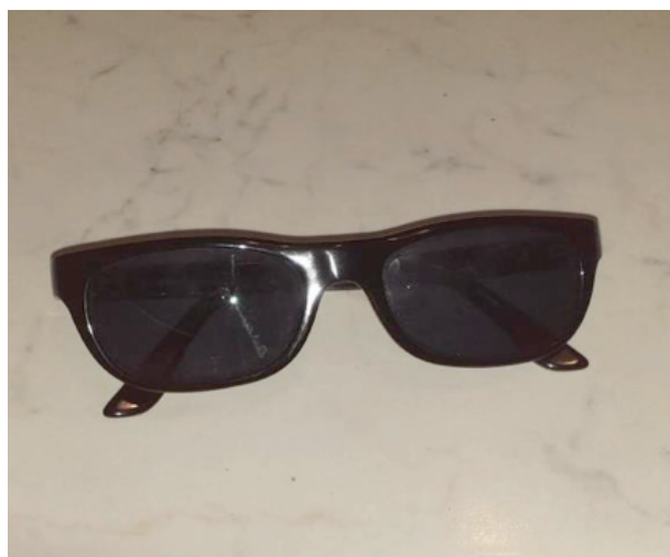
Figure 9. Dark glasses as a filter to the world

Showing the photo to the reference operator, we received a reaction of satisfaction: “I am pleased, I am pleased that he recovers the drugs ...”, he says, in fact, that the patient has previously been discontinuous in taking pharmacological therapies: “... so much so that he always suspended them...”. Also in the initial presentation the operator describes the difficulties: “there was a bit to be fought with regard to pharmacological