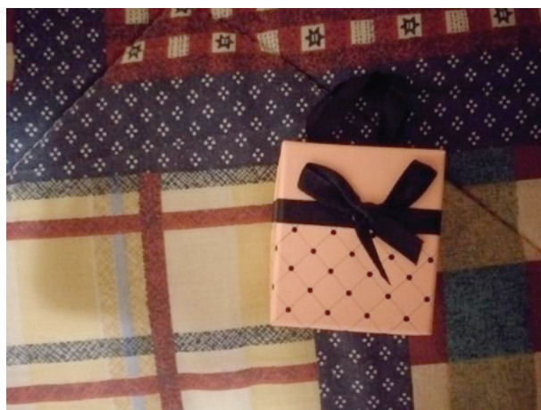
Figure 6. Time as a gift

Also in his initial presentation he had talked about relapses and therapies: “... I tried several drugs but they weren’t good...” and speaks of extreme gestures: “... several suicide attempts...” and cares through drugs and interviews with therapist “... a therapist... is giving me a big help...”. His concept of well-being is represented by a pharmacological and relational aspect.