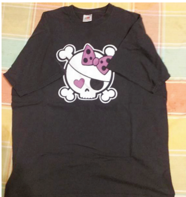
Figure 5. Take time for yourself!

In this image the user affirmed “... it’s a symbolic photo” (Figure 6). When the interviewer asks why she put it in the “perception of time” area, she explains that the biggest gift a person can give is time. Then through the symbol of the gift comes to a transmitted