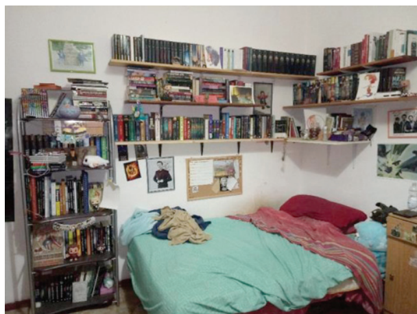
Figure 10. A safe place

The selected photo, belonging to user 3 (U3), depicts the corner of a one-bedroom room where the bed and shelves above it are clearly visible full of books and personal objects.