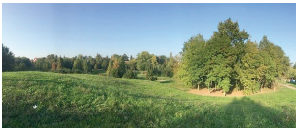
Figure 12. A place in the open air

represented by the bedroom especially as a source of privacy and relaxation.