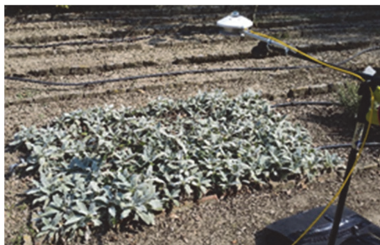
Figure 2. Measurement of canopy albedo on Stachys byzantina according to ASTM E1918-16 (2016) (Modena, September 2016)