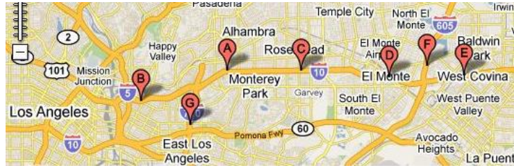
Fig. 1. The case study used in the experiments: 7 measurement stations placed on three different Highways in the area of East Los Angeles.

speed of the vehicles. The PeMS infrastructure collects filtered and aggregated flow and occupancy from single loop detectors, and provides an estimate of the speed [9] and other derived quantities. In some locations, a double loop detector is used to directly measure the instantaneous speed of the vehicles. All traffic detectors report measurements every 30 seconds.