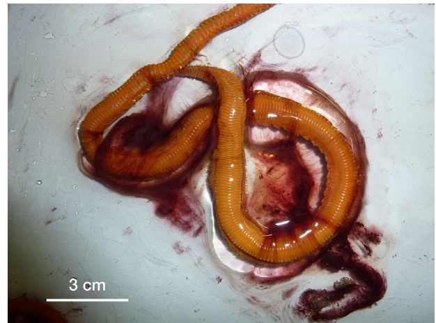
Fig. 1. – Halla parthenopeia (40 cm long) a few minutes after mechanical stimulation, surrounded by abundant transparent mucus and, further outward, by purple mucus.

The density of the transparent and purple mucus were similar to that of the sea water ( 1.022\ g\ l^{-1} ). For