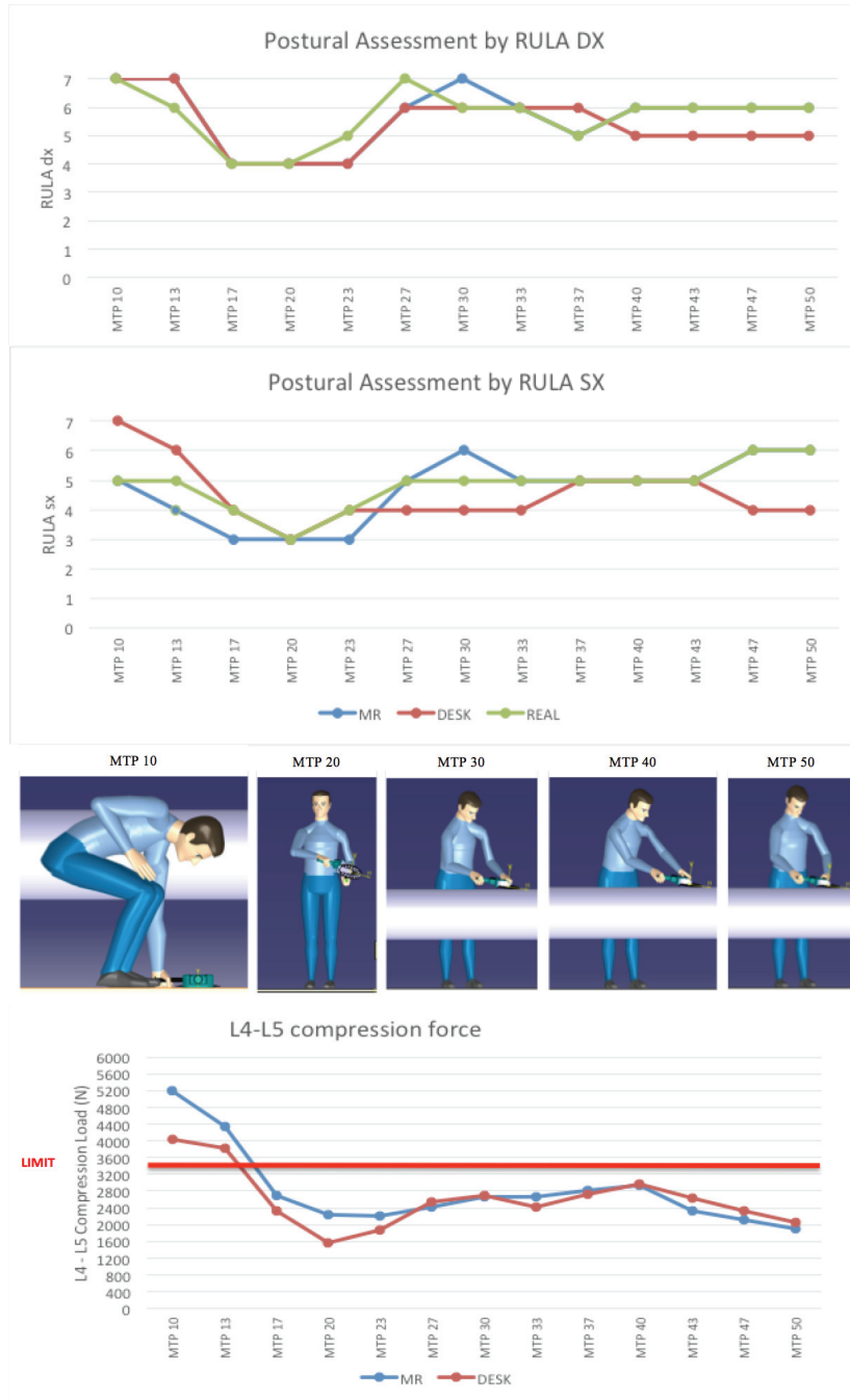
Fig. 3. Example of simulation results for the case study: comparison among different simulation modality (based on mixed reality immersive environment, desktop-based and observation of real users)

real operators' observation and checklist carried out by experts. Fig.3 shows the results analysis comparison for two physical stress indicators: RULA on the right and left side of the human body, and the force compression on L4-L5 lumbar vertebrae, for one of the analysed tasks (i.e. grinding on external surfaces).